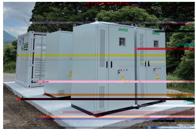
Fig. 2 Jinko ESS 215kWh DC Blocks

The DC block use lithium iron phosphate batteries, equipped with a liquid cooling system and aerosol fire protection, designed to meet the requirements of the Japanese Fire Services Law, and equipped with the Jinko ESS cloud platform.